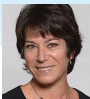
Leslie F. Spasser Polsinelli PC